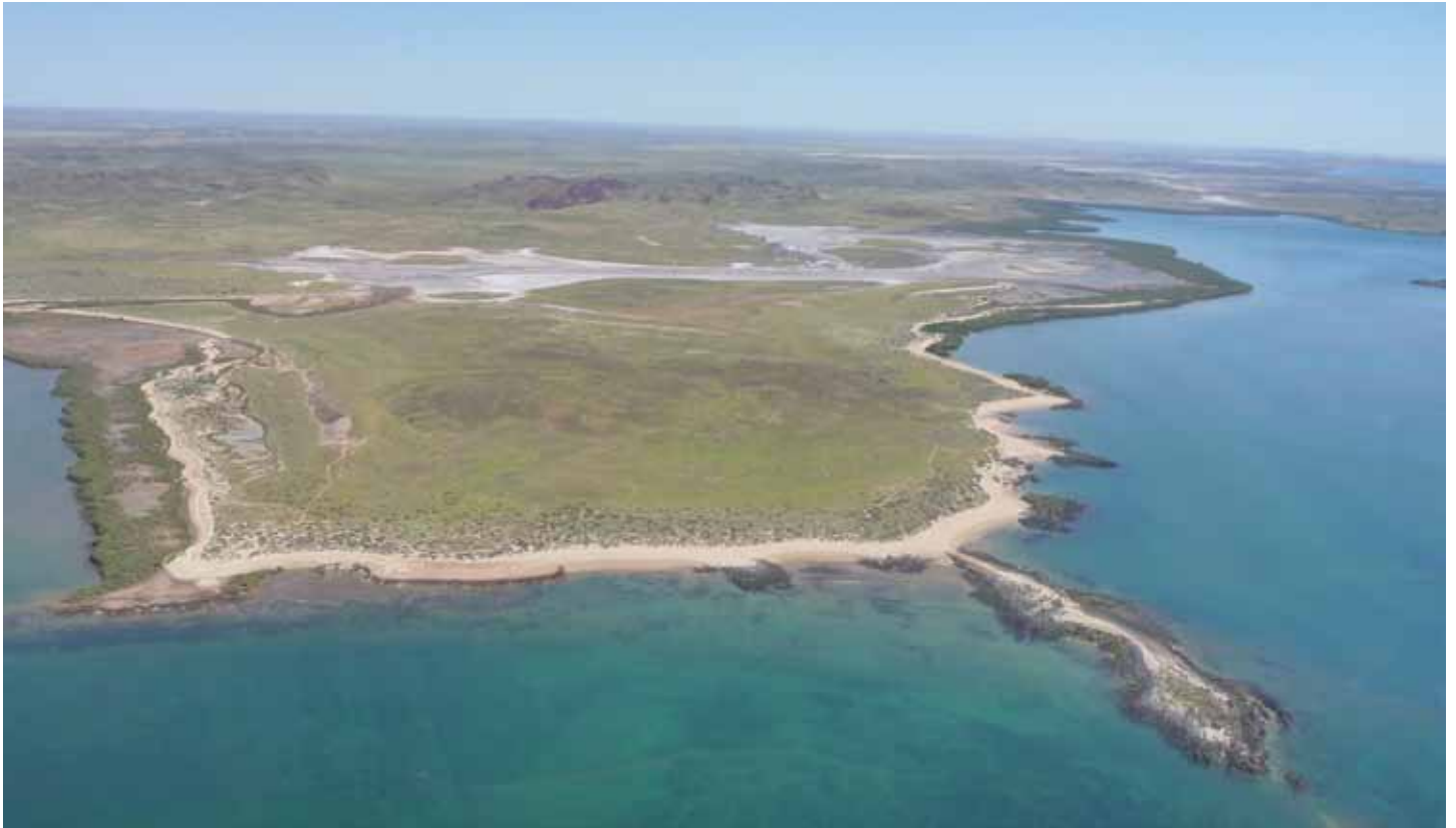
Anketell aerial view