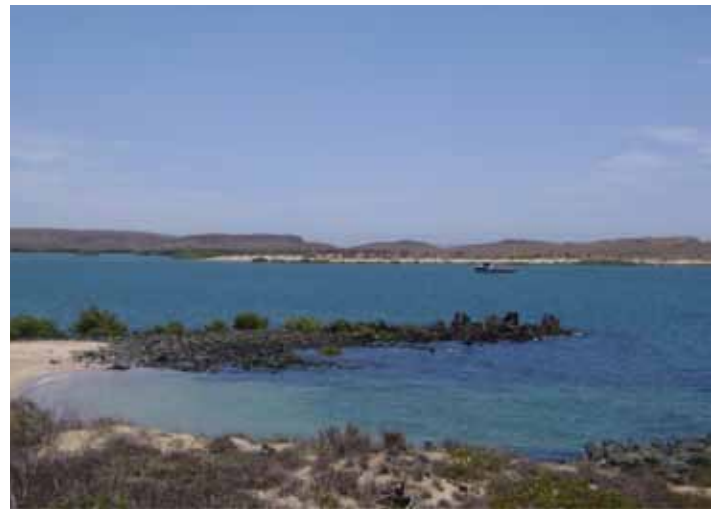
Dixon Island from Anketell

The Government and the NAC will also negotiate a heritage protection agreement that identifies and reduces risks of adverse impacts on heritage sites or objects in accordance with the Aboriginal Heritage Act 1972 (WA) .