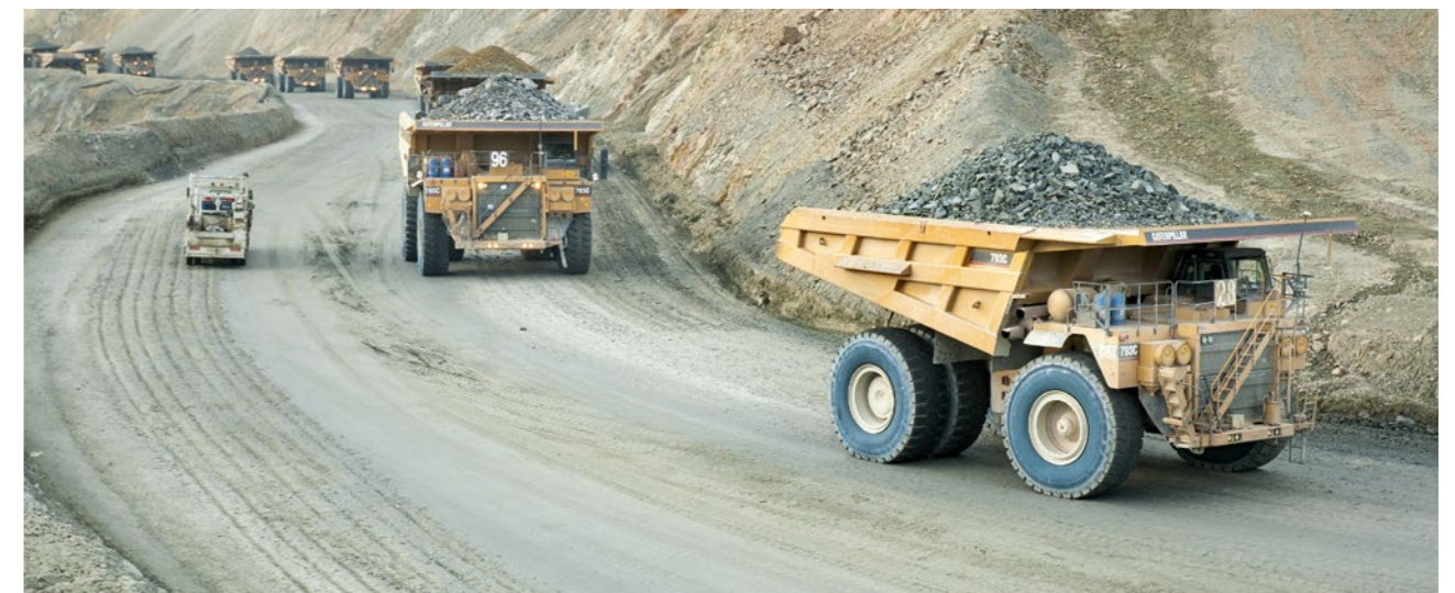
Copper mining in Indonesia.

Within the market, the Grasberg copper/gold mine has a unique status, as the largest mine in the country, a significant underground operation in a market dominated by open pit mining. In 2018, it was one of the first foreign owned and operated mines to transition to majority Indonesian ownership.